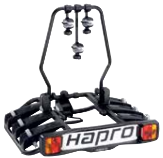
Strength and reliability.